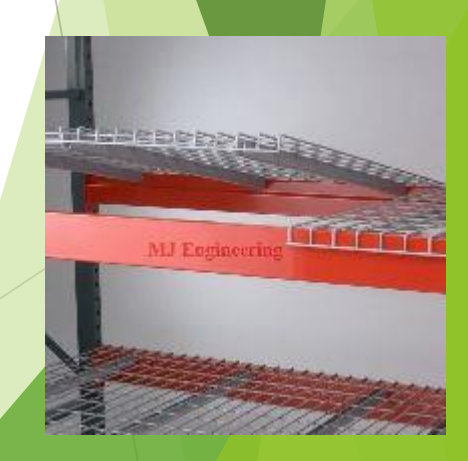
Wire mesh decking