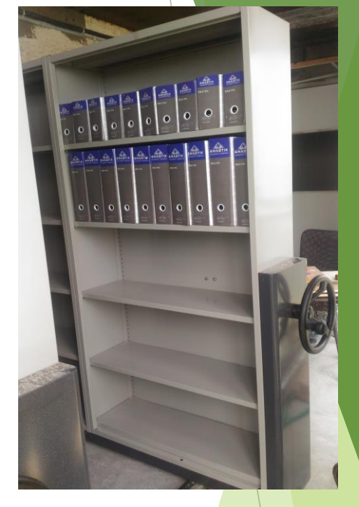
File arrangement in compactor