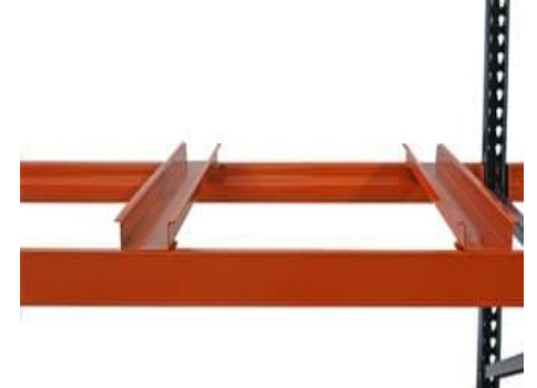
Pallet skid channel