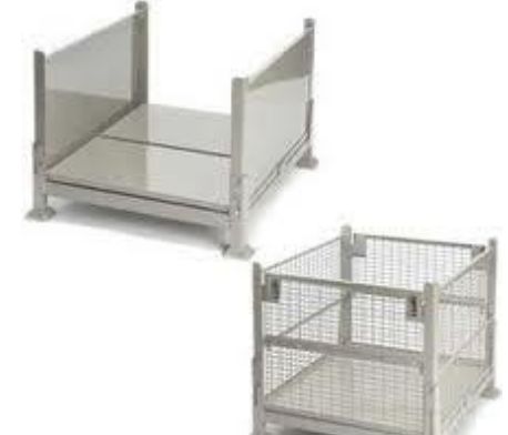
Heavy duty stack bins