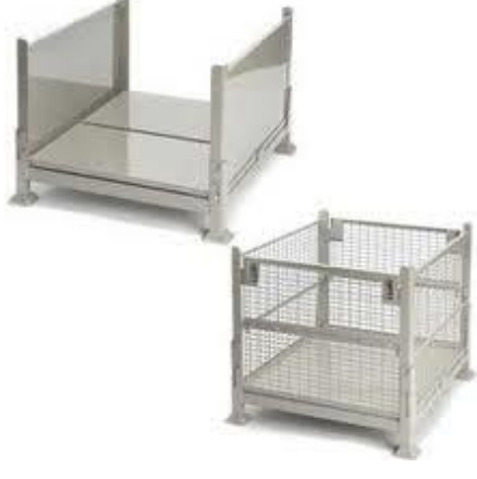
Foldable heavy duty bin