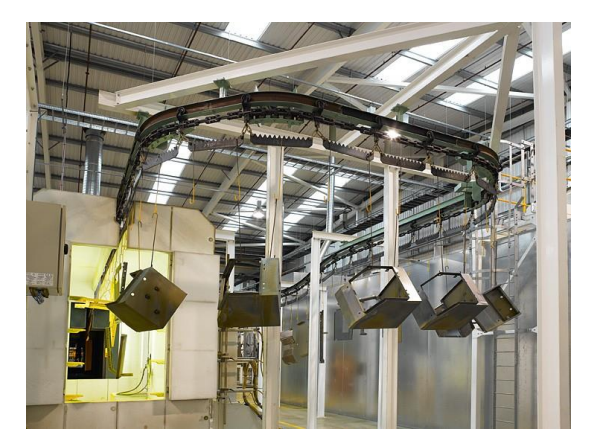
FULLY CONVEYORISED POWDER COATING PLANT