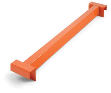
Pallet support bar