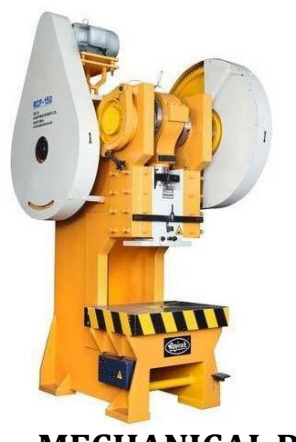
MECHANICAL PRESS M/C