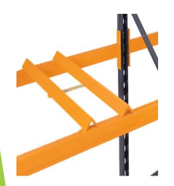
coil support bar