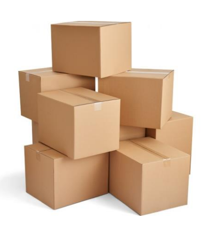
COMPLETE ASSEMBLY AND PACKAGING UNIT