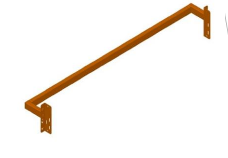
Pallet back stopper